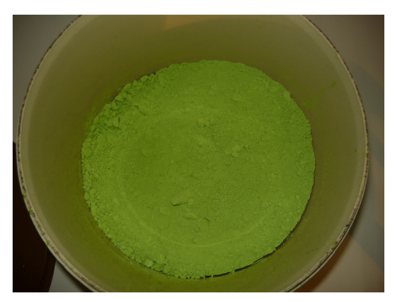
Figure 4. Powdered Nannochloropsis oculata biomass, obtained at the end of the drying process.

With a thermocouple type J, positioned in the exit tubing, the material exit flow temperature (T_m) was measured. The measure errors associated with the material exit temperature are available at Exacta Group website, a thermocouple and other temperature sensors producer. These limits meet the ASTM e-230 standards, union reference at 273.00 K, disregarding installation or system errors.