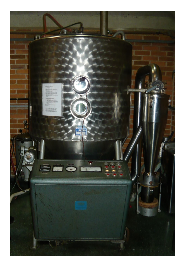
Figure 3. Spray dryer used at the drying tests.