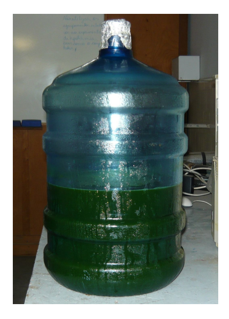
Figure 1. Microalgae after flocculation, settling and packaging in 0.02 m<sup>3</sup> vessel.

Nannochloropsis oculata microalgae were grown in 0.2 m<sup>3</sup> tanks by Grupo Integrado de Aquicultura e Estudos Ambientais from Federal University of Paraná, in appropriated culture broth, with aeration, during 10 days, in a greenhouse. After this period, the microalgae were separated from the growth solution by flocculation with pH change, using 1.0 M (molar) sodium hydroxide (NaOH) solution. This causes microalgae flocculation, and then settling. The bottom solution was transferred to 0.02 m<sup>3</sup> vessels, as shown at Fig. 1. The clarified fraction, with low cell concentration, was neutralized and discarded. The solution was centrifuged during 300 seconds, at 3500 rpm, to remove the water excess still present.