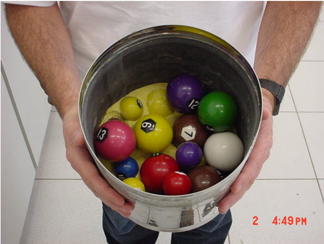
Figure 2 - Bulge with the balls

The “Figure 2” shows the bulge and the billiards’balls .