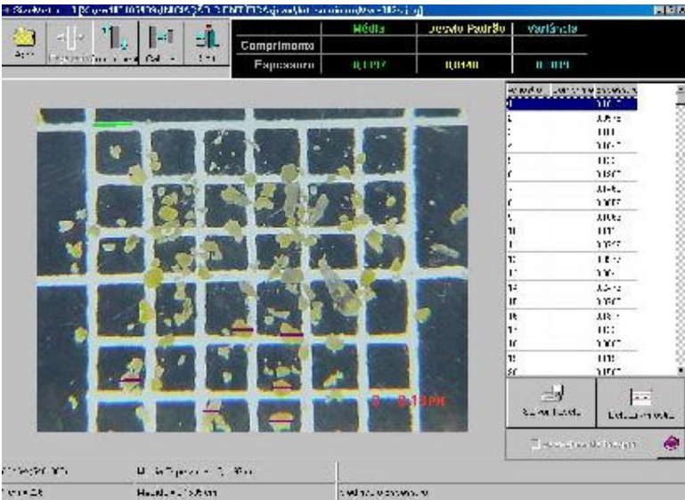
Figure 4 - Analysis of microscopy optics of the maize flour after been submitted to the milling process with billiards`s balls per 5 minutes

The “Figure 4” shows the image of analysis of the microscopy optics of the maize flour after been milled by billiard`s balls per 300 seconds.