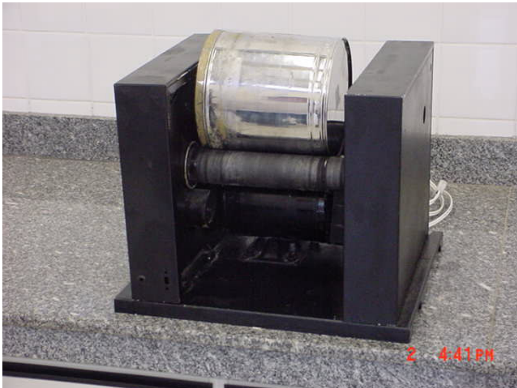
Figure 1 - Ball's Mill

The "Figure 1" shows the ball's mill constructed in the laboratory of Engineering by the group.